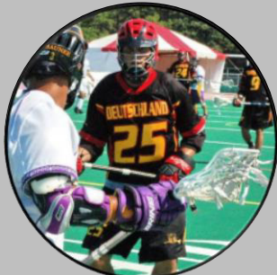
Frederic du Bois-Reymond