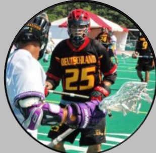
Frederic du Bois-Reymond